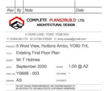
Existing First Floor Plan - 5 Wold View, Huttons Ambo, YO60 7HL